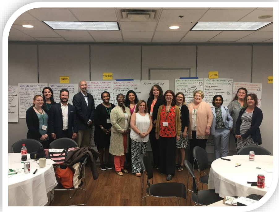
State Coalition Task Group Members in Des Moines, Iowa after the Multi-State Listening Session

The multi-state listening session spanned two days. Attendees were invited to attend the conference and an informal networking dinner prior to the meeting. On day two, coalition leaders gathered to engage in interactive activities and facilitated conversations about their work. The goal of this listening session was to build connections between HPV vaccination coalitions, share information and strategies, and inform task group efforts.